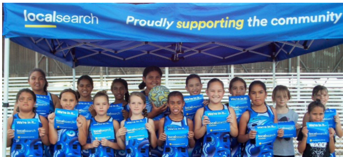
The Te Whanau Netball Club